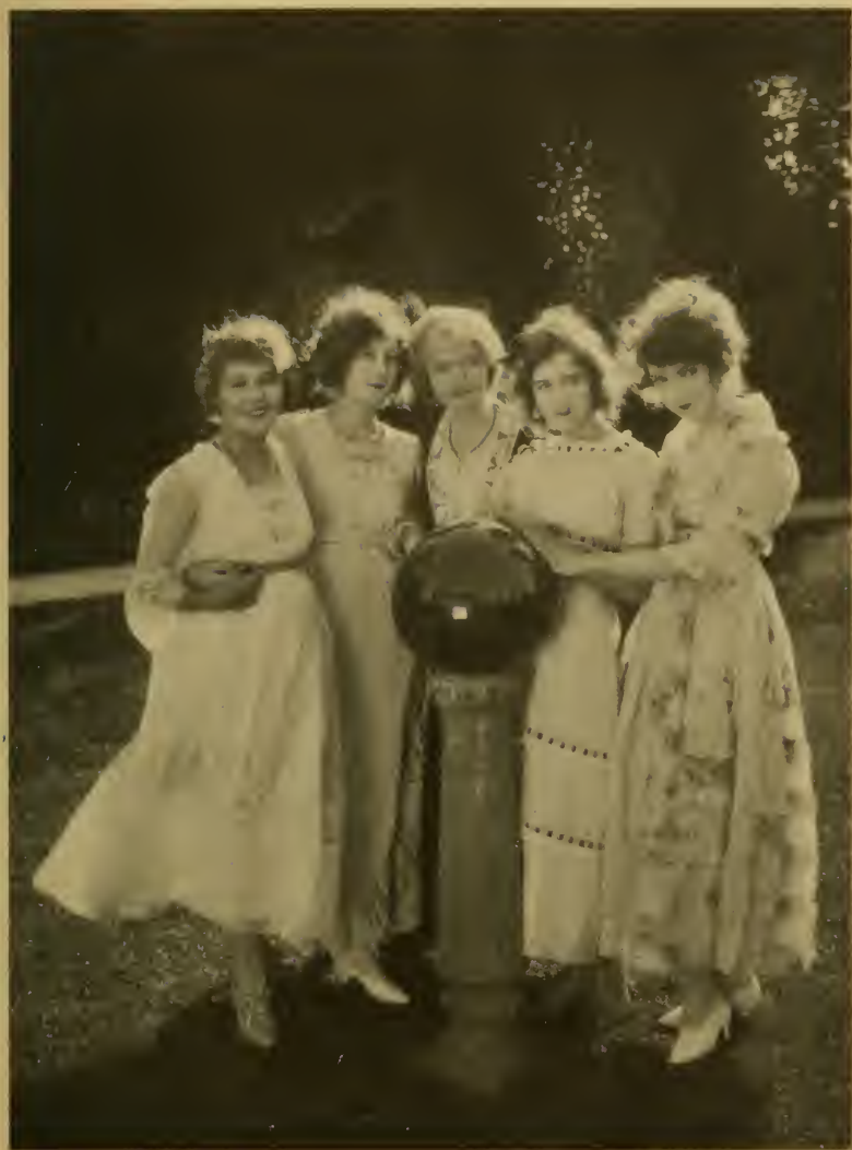
MRS. GISH AND "HER GIRLS"

Mary Pickford, Mildred Harris, Mrs. Gish, Dorothy and Lillian